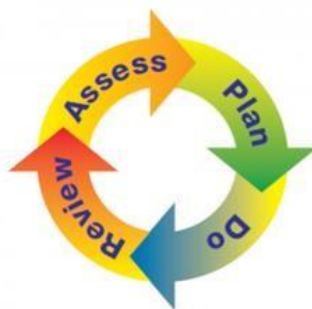
(The Graduated Approach)